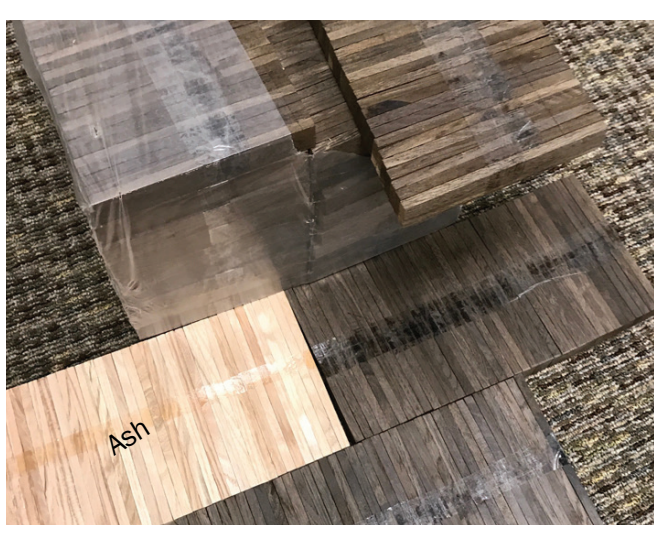
Acclimation of Edge Grain panels

Humidity maintained at or below 25-30% can adversely affect wood components and result in an EMC below 6%. This condition can cause greater than normal shrinkage with associated cracks.