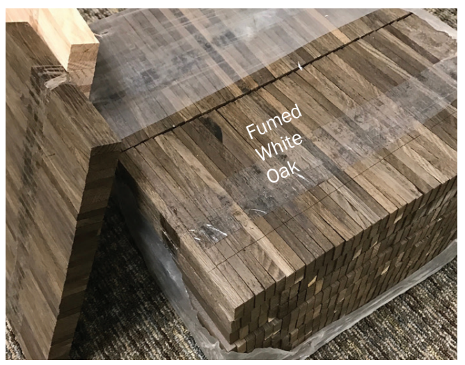
Acclimation of Edge Grain panels

We are often questioned about the humidity being too high or too low. Humidity maintained above 60-70% at normal residential temperatures can adversely affect wood components. Humidity sustained at or above this level can result in an EMC of 12% or more with associated expansion.