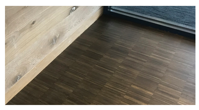
Edge Grain Fumed White Oak with urethane finish

We recommend a water-based urethane (Bona Traffic) or a solvent-based urethane (Bona Woodline Satin) on our Edge Grain flooring. Apply one or more applications of urethane finish, water-based or solvent-based. Solvent-based urethanes are preferable. Apply thin coats until the surface is uniformly sealed. Four applications of a urethane may be needed. NOTE: If you have any questions about finish selection or applications please contact us. You may also visit the website, bonakemi.com.